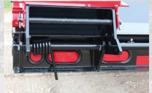
One-way spring-assist ramps and grommet mounted LED lights.