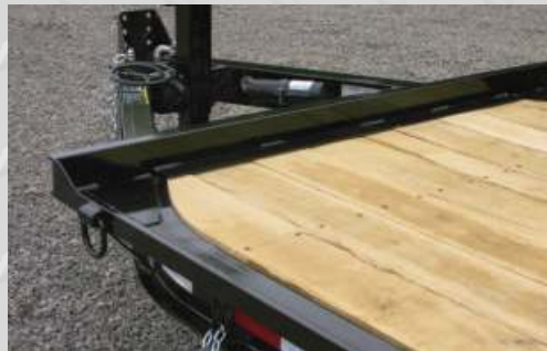
Formed frame and tongue provide a strong and integral structure for the trailer. The Towmaster "T-Series" has a squared-deck and 2" lip.