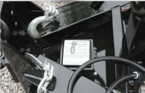
Sealed battery break-away system charges while plugged into the tow vehicle and can be checked at the press of a button.