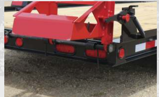
Strong, channel side ladder-style ramps with patented Auto-Latch® ramp hold-ups.