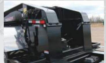
Optional Air-Pin Neck

Towmaster® detachable gooseneck trailers are heavy-haulers. We offer two neck attachment in the 35-ton, 50-ton, and 55-ton versions. This design features hydraulic cylinders mounted to a crossbar for load adjustment and utilizes a king-pin load plate that attaches to the main deck fifth-wheel receiver. Integrated 5-position load blocks offer ride height adjustment. The fit and finish is unmatched. Air-pin neck hookup is optional on these models.