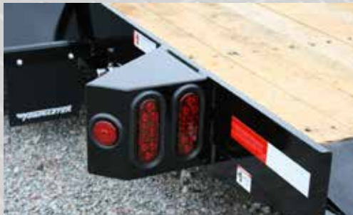
Grommet mounted LED lights are standard.