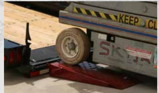
The "SL" (Scissor Lift) option included ramps to lower the loading incline.