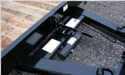
Positive locking (over-center) latch system keeps deck secured to the frame.