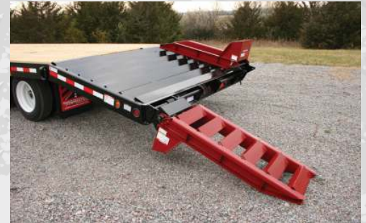
Two-way spring assist ramps allow you to easily lift ramps off deck and also off the ground. Grommet mounted LED lights are standard.