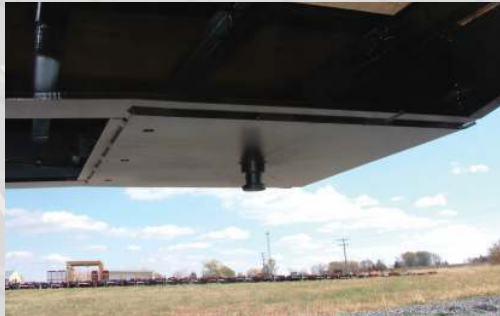
S.A.E. King Pin with smooth approach plate for easy hook-up.

The Towmaster® T-50RG and T-70RG Rigid Gooseneck trailers are ready to haul your heavy equipment behind your fifth-wheel tractor. They feature dual axles, two-way spring-assist ramps, Hutchens® suspension and sealed wiring. A 10-foot top deck can haul a skid-loader or other smaller equipment (optional loading ramps required). A triple axle is available on the T-70RG.