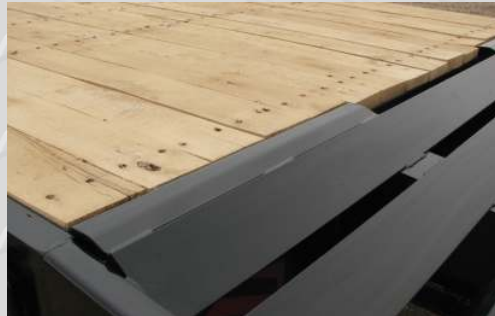
Wood protectors are standard on Towmaster T-series trailers and protect the end of the deck boards.