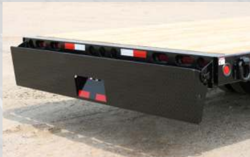
Patented automatic kick-out ramp doubles as under-ride protection.

The Towmaster® deck-over tilt trailer offers convenience and durability. No ramps to hassle with, simply tilt the deck and drive on or off. Our patented automatic kick-out ramp doubles as under-ride protection. The deck is locked with a single-lever twin-latch system. A stationary forward deck is standard and a deck cushion cylinder eases the deck onto the frame.