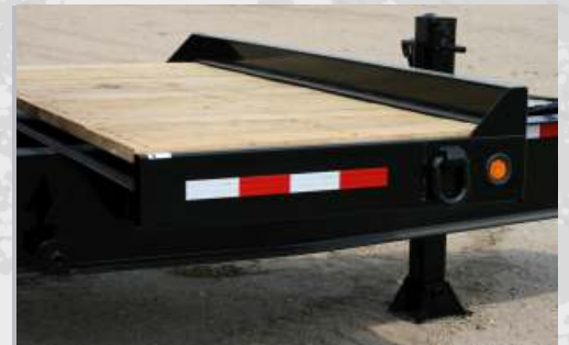
4-foot stationary deck is standard and allows room for longer equipment and the added length makes towing easier.