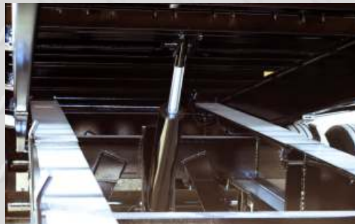
Cushion cylinder controls the deck tilt when loading or unloading equipment. Optional Hutchens® 9700 suspension shown.