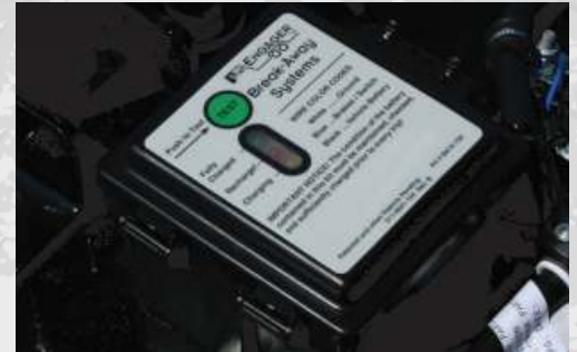
Sealed battery break-away system charges while plugged into the tow vehicle and can be checked at the press of a button.