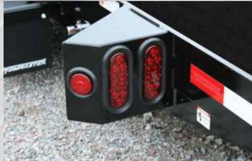
Grommet mounted LED lights are standard.