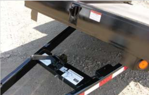
Positive locking (over-center) latch system keeps deck secured to the frame.