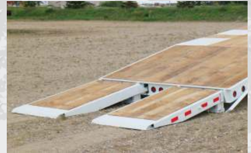
Optional 6-foot air ramps offer an even lower approach angle.