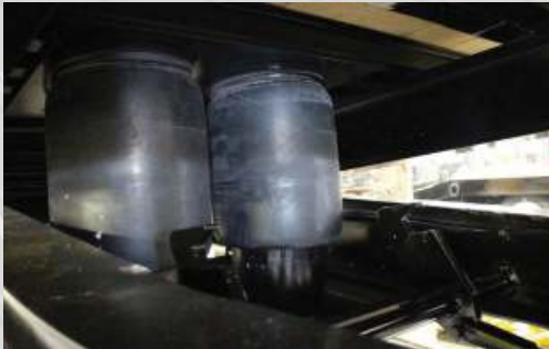
Dual air-bag design uses air from the tow vehicle's system.

Towmaster's® deck-over air-tilt trailers offer convenience and easy loading by tilting the bed using air from the tow vehicle's system. This provides a clean and efficient way of tilting the deck without the use of hydraulics. Optional ramps can be manual or air-operated. Simply tilt the deck, drive on or off and level the deck back down. The tilt deck trailer features a single-lever twin-latch system to secure the deck to the frame. The low load angle allows for easy equipment loading and unloading.