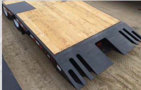
Standard approach ramp provides low approach angle for easy loading.