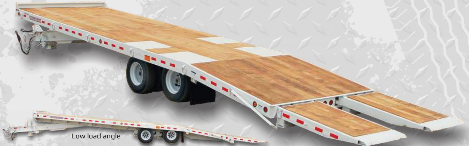
Low load angle

Towmaster's® deck-over air-tilt trailers offer convenience and easy loading by tilting the bed using air from the tow vehicle's system. This provides a clean and efficient way of tilting the deck without the use of hydraulics. Optional ramps can be manual or air-operated. Simply tilt the deck, drive on or off and level the deck back down. The tilt deck trailer features a single-lever twin-latch system to secure the deck to the frame. The low load angle allows for easy equipment loading and unloading.