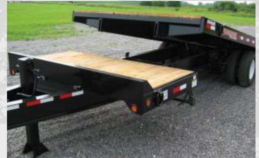
4-foot stationary deck is standard and allows room for longer equipment and the added length makes towing easier.