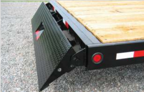
Patented automatic kick-out ramp doubles as under-ride protection.

The Towmaster® deck-over tilt trailers offer convenience and durability. No ramps to hassle with, simply tilt the deck and drive on or off. It features our patented automatic kick-out ramp that doubles as under-ride protection, a single-lever twin-latch system, stationary forward deck, Hutchens® suspension, and a deck cushion cylinder to ease the deck up and down.