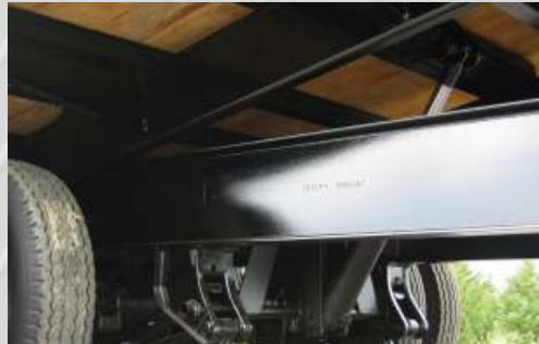
Cushion cylinder controls the deck tilt when loading or unloading equipment. Optional Hutchens® 9700 suspension shown.