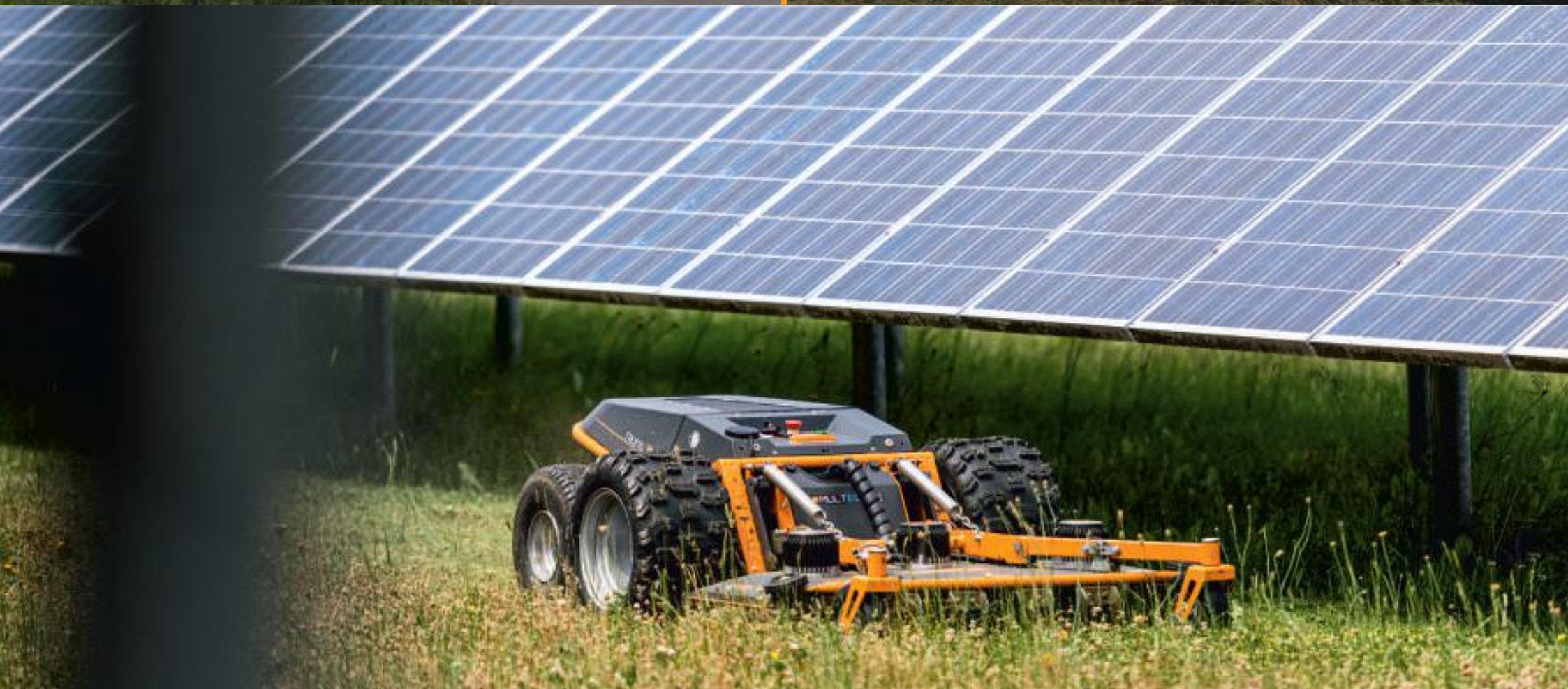
ENERGY PARKS / SOLAR FARMS