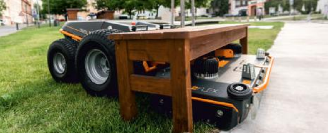
LOW CLEARANCE SPACES