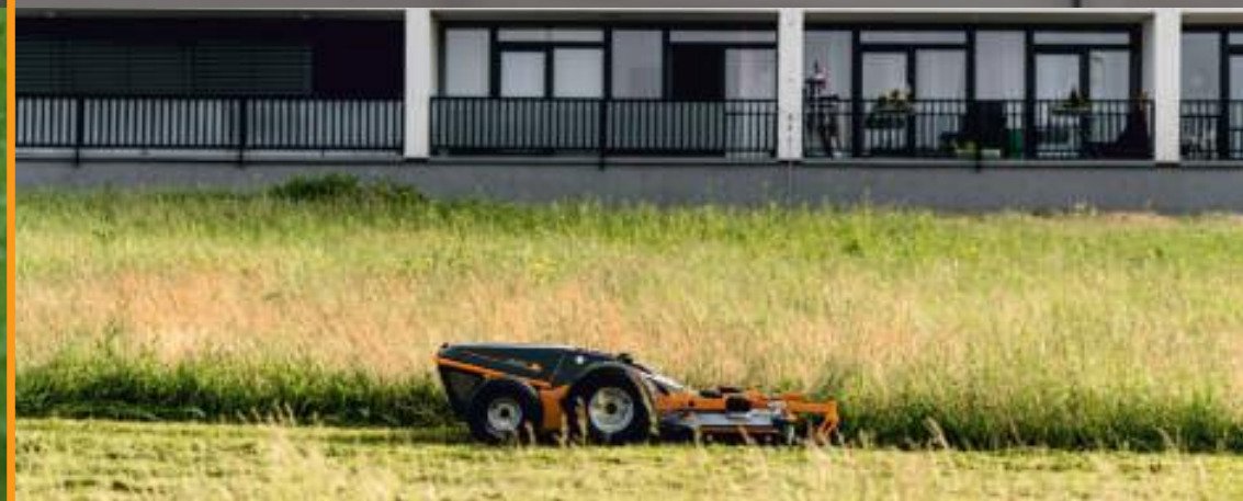
NOISE REGULATED AREAS