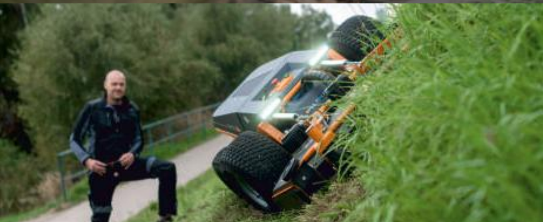
SLOPES AND EMBANKMENTS