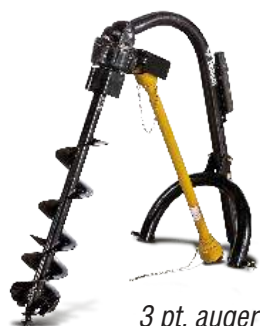
3 pt. auger