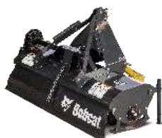
3 pt. tiller