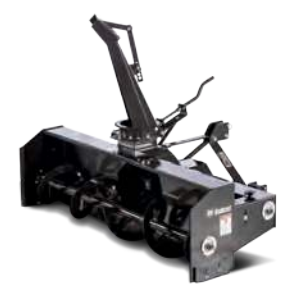
3 pt. snowblower