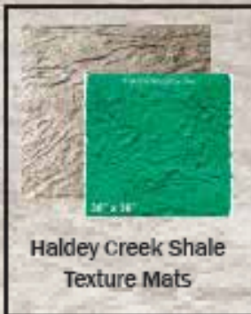
Haldey Creek Shale Texture Mats

Each set of mats contains 1 - 18" x 36" and 3 - 48" mats and a tamper. All rental sets are $100/day plus tax and damage waiver. Requires an open charge account or a valid CO drivers license and credit card. Available in Colorado Springs, Commerce City, Golden, Parker and Windsor only.