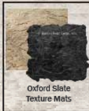
Oxford Slate Texture Mats