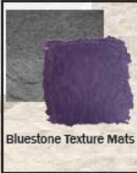
Bluestone Texture Mats