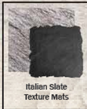
Italian Slate Texture Mats