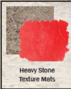
Heavy Stone Texture Mats